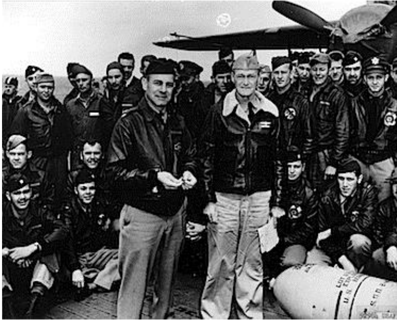
Figure 5: The Doolittle Raiders gathered aboard Hornet for a photograph.

Compiled and Written by Museum Historian Bob Fish