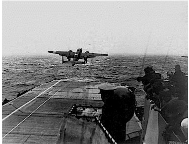
Figure 6: A Doolittle B-25 launches from the deck of CV-8.

As a result of these problems, the crews realized they would not be able to reach their intended base in China, leaving them the option of either bailing out over eastern China or crash landing along the Chinese coast. When the action was over, fifteen planes had been destroyed in crashes. The crew who flew to Russia landed near Vladivostok, where their B-25 was confiscated and the crew interned until escaping in May 1943.