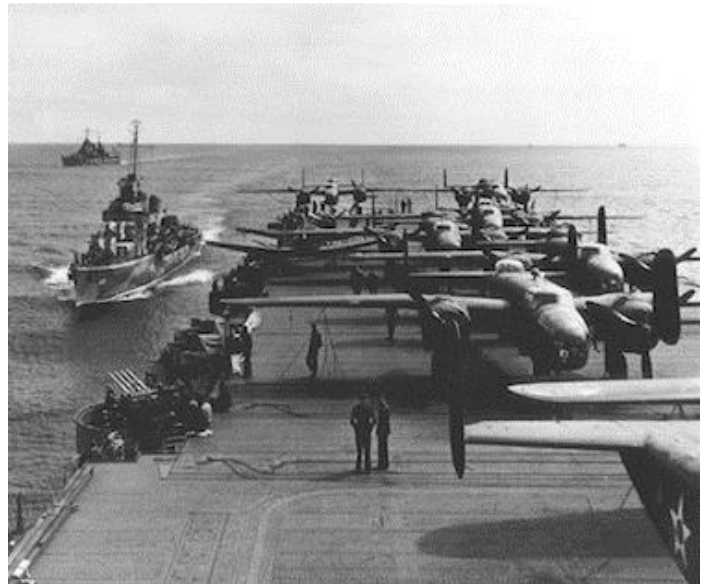
Figure 3: The Doolittle Raiders aboard USS Hornet .

On March 31 st , Hornet tied up at Alameda NAS. On this same day, the Army B-25s were flown to Alameda from Sacramento. Hornet's normal aircraft were stored below in the hangar deck since the B-25s would not fit in there. Within 24 hours, 16 of the Army bombers were loaded onto Hornet's flight deck and tied down in the order of their expected launch position. After their 5-man flight crews and various maintenance personnel had boarded (134 officers and enlisted men in all), Hornet cast off and moored in the middle of SF Bay. With an untested ship's crew, Mitscher did not want to risk maneuvering the 19,800 ton carrier through the fog at night. According to Hornet's deck log 5 , she weighed anchor at 10:18 AM on April 2 nd and began her top-secret voyage, steaming underneath the Golden Gate Bridge on a compass heading of 270 degrees. Rumors were circulated for the curious public that the ship was simply ferrying Army bombers to some outpost in the Pacific. In reality, she was headed for a position 500 nautical miles east of Japan.