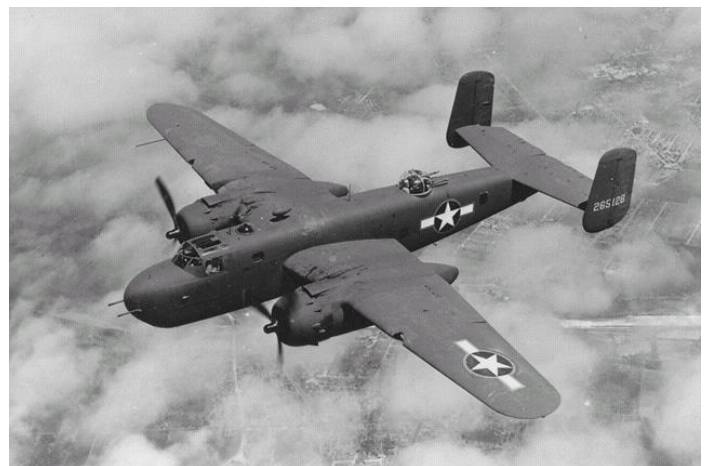
Figure 1: A B-25 Mitchell bomber.

The plan was presented to General "Hap" Arnold, head of the U.S. Army Air Forces, who