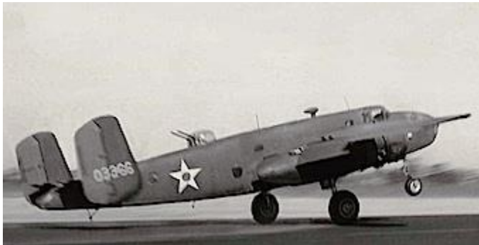
Figure 2: A B-25 taking off from a land-based landing strip.