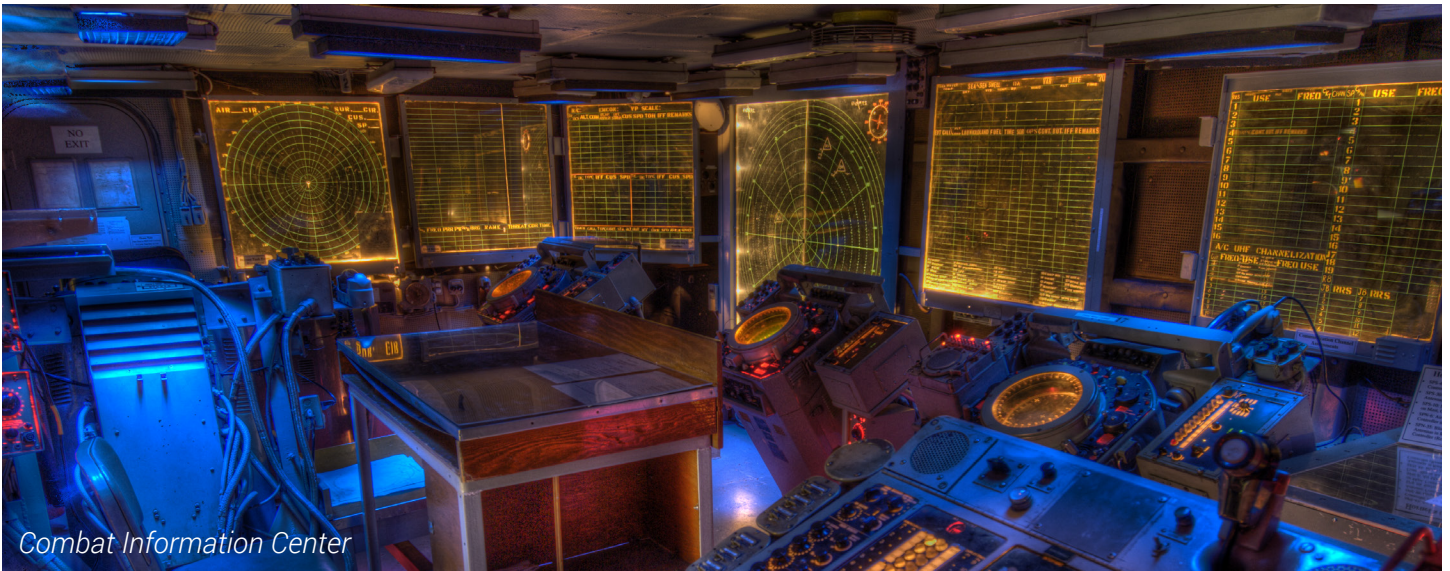
Combat Information Center