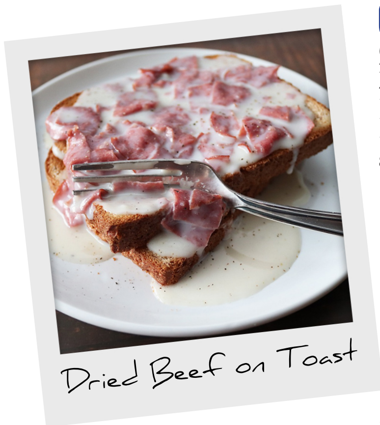
Dried Beef on Toast

NOTE.—Soak meat in warm water 15 to 20 minutes if too salty.