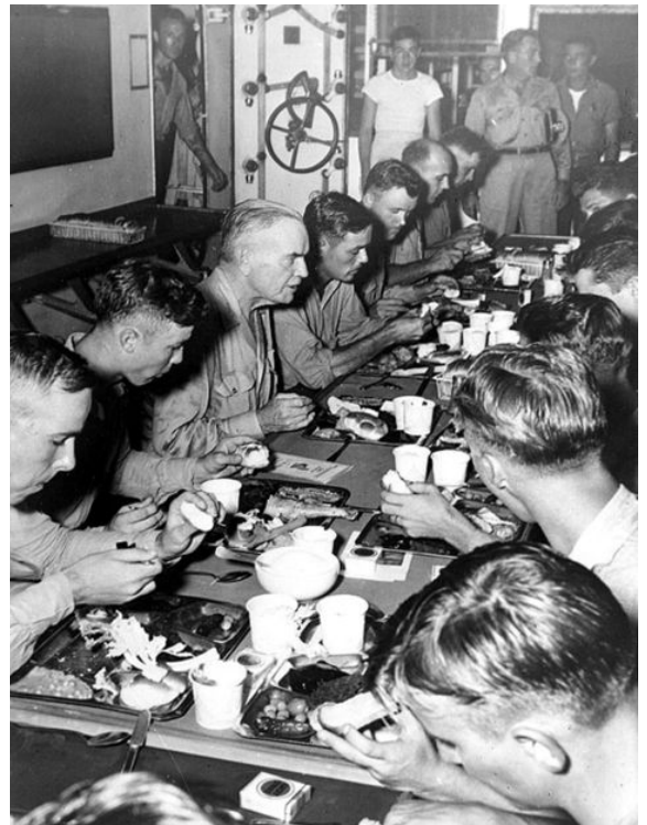
Admiral Halsey joins in a WWII thanksgiving meal

They usually had more than one option in each category for variety and to make sure all of the 3,500 men had something good to eat.