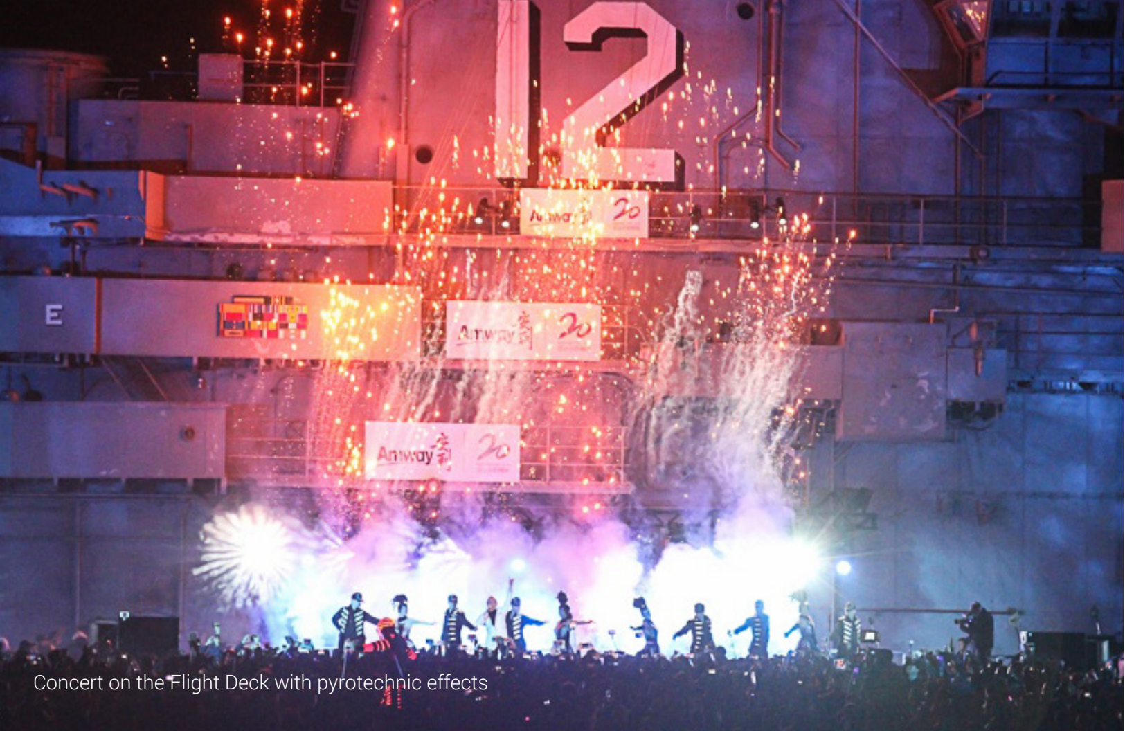
Concert on the Flight Deck with pyrotechnic effects