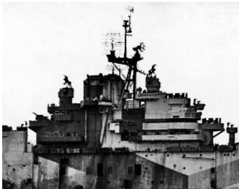
Closer view of the Island of USS Hornet CV-12.