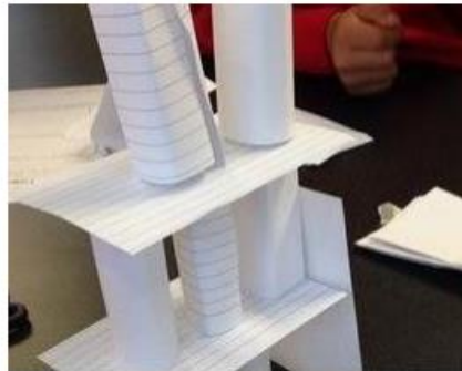
Suggested shapes for your island build!