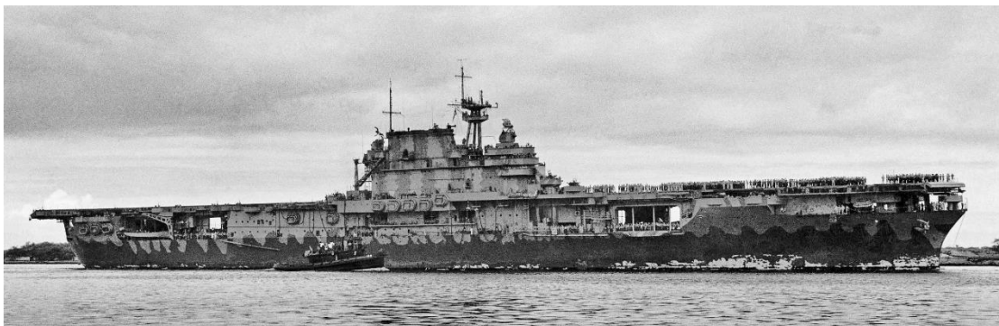
Image of USS Hornet CV-8.