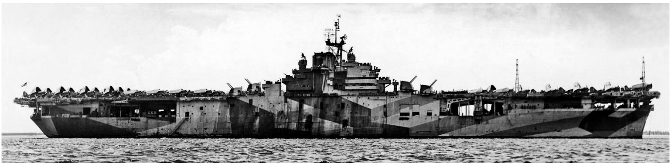
Image of USS Hornet CV-12.