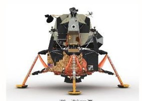
1969 finalized design