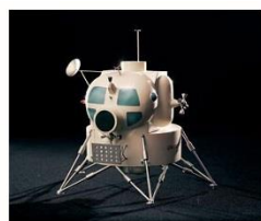
1962 refinement (5 legged)