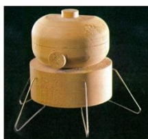
1962 Grumman Prototype