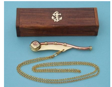
A Bosun's Pipe

Flight Simulator Tickets are included in your package and the tickets will be issued to the group leader upon arrival. Please safeguard your ticket! Lost tickets cannot be replaced.