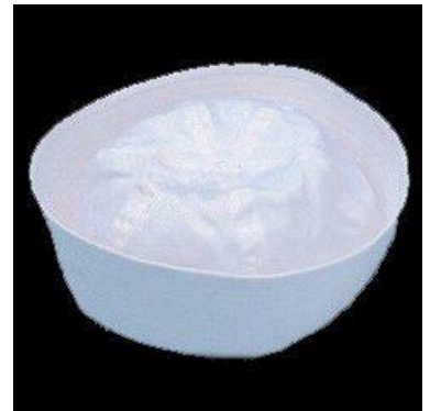
Sailor's Dixie Cup Hat